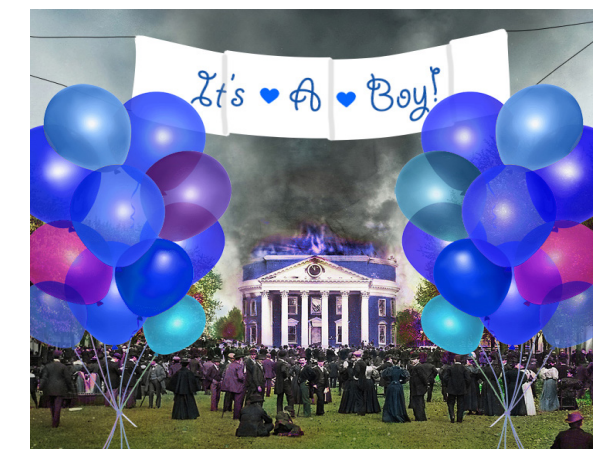
Rotunda Set Ablaze in Botched Gender Reveal

No one is certain what the future holds for UVA men's basketball, but one can be sure that there will be a significant decline in tom-foolery and a steady drop in party-rocking. No more human pyramids made up of the shortest teammates so they can finally dunk, no more body-painting to camouflage into the floors, and absolutely no more fast-breaks; that shit is unfair.