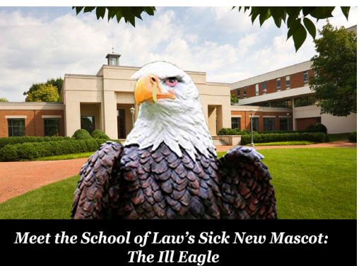
Meet the School of Law's Sick New Mascot: The Ill Eagle